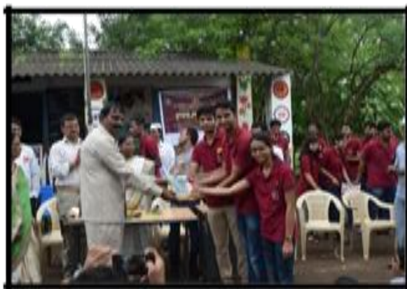
Image 3: Book Donation