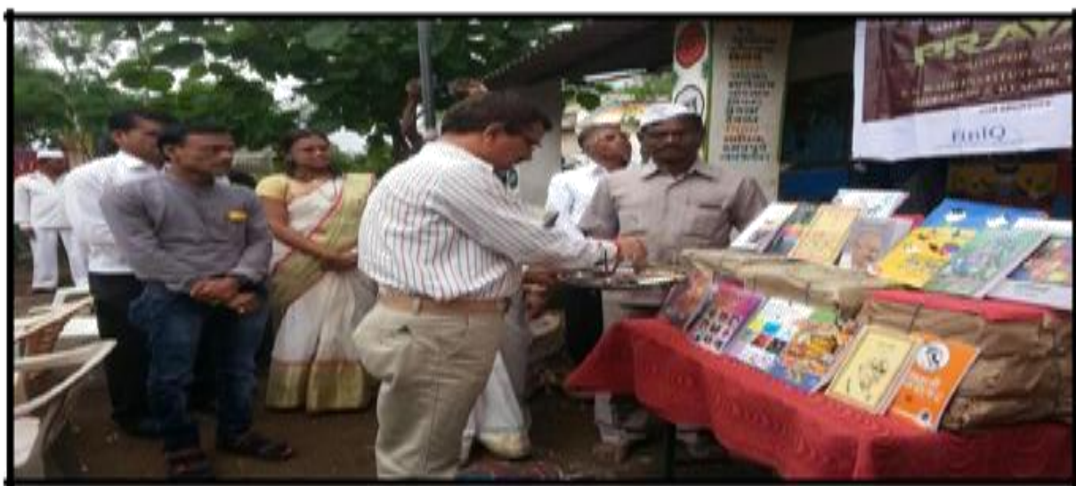
Image 2: Inauguration