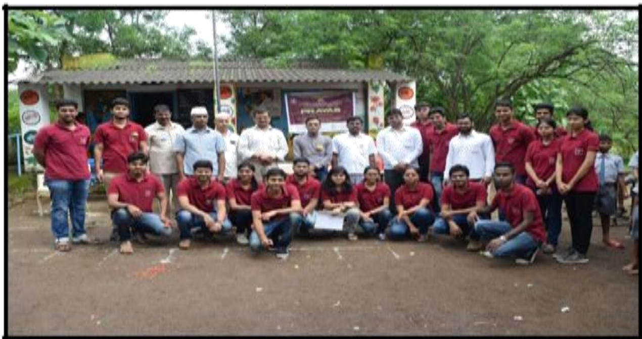
Image 5: Team prayas with honorable guests.